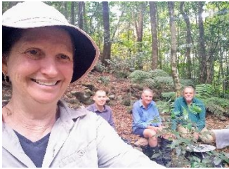
Photo to come. It is still listed on the Australian Trig points. A beautiful view, but you can tell the top gets sooo much weather as it so tightly overgrown- so much infact we found it hard to push through! We altered our day because of its dense growth! Only a couple if places where you could see a view out- even the Trig was leaning to the left!

ferns. The highlight for me was the Trig we came across.