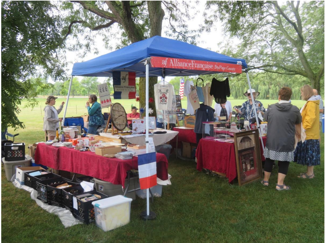
Pictured above – our booth at Cantigny Park’s French Connection Day in August.