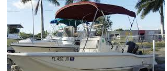
Outside off Southern Blvd 10 th Year