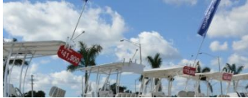
Boat Show and Sale – Marine Flea Market – BBQ