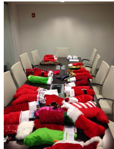
2015: Forty stockings from forty donors

The goal for 2016 is 200 stockings and you can help! See Page 2 for details.