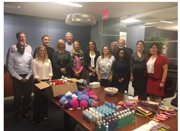
Stocking stuffing party at Nossaman, LLP

SFK began in 2014 and delivered just 40 stockings to CASA of DC. In 2015 SFK delivered 162 stockings – 40 to CASA of DC, 40 to CASA of Prince Georges County, 30 to CASA of Montgomery County, 10 to Carroll County, 10 to Frederick County, 22 to SCAN Northern Virginia and 10 to the Mesa Grande Indians of CA. In 2016 we delivered 200 stockings and added Anne Arundel and Fairfax Counties to our list of recipients. In 2017 we delivered 300 stockings and added Winchester and Baltimore counties.