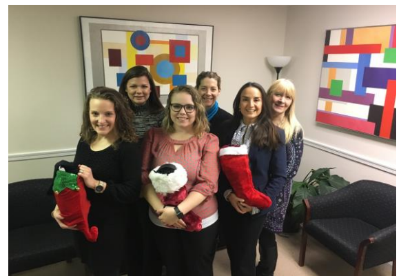
Fairfax County CASA Staff