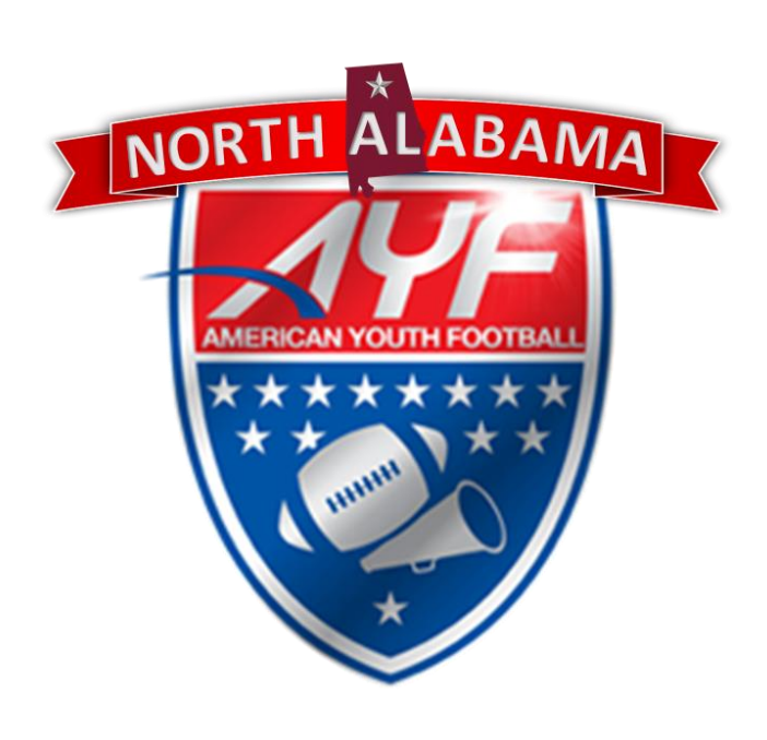
2021 North Alabama American Youth Football