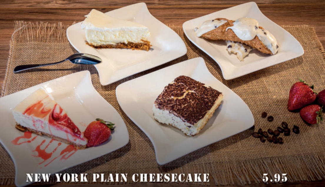
NEW YORK PLAIN CHEESECAKE