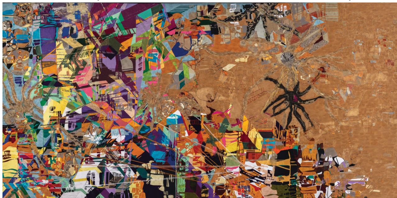
CHRISTINA ROTHE, 2020. THE SPACES INBETWEEN. 4' x 8'

OCTOBER 2, 2020 THROUGH FEBRUARY 12, 2021