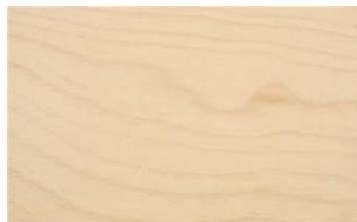
Natural Baltic Birch

Colorich is a through-color wood fiber panel. Individual fibers are impregnated with organic dye and chemically bonded by resin specially developed to give the panel its special properties. Colorich fits somewhere between a wood fiber board and a solid surface, because of the specially formulated resin within the board.