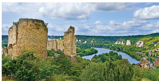
Visit Château Gaillard, former stronghold of Richard the Lionheart

Your welcome reception aboard the lovely AmaLyra highlights the sparkling wines of France. Wines of the Alsace and Loire Valley will also be featured during three Wine Seminars and Wine Dinners apiece, including an evening in Vernon with a special guest you won't want to miss!