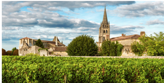
Taste Grand Cru Classé wines in Saint-Émilion

Be treated to a selection of red wines from Bordeaux at a special welcome reception. Plus, expand your palate at three mouthwatering Wine Dinners featuring wines from Bordeaux's famed Right and Left banks and a local châteaux in Pauillac. You may also attend three special Wine Seminars encompassing the unique profiles of wines from Sauternes and Barsac, Bordeaux's Left Bank and some lesser-known French varietals.