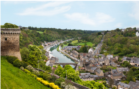
Explore Dijon, the "Birthplace of Mustard"

A selection of fine white wines will be poured during your welcome reception aboard the AmaCello . Your Wine Seminars will highlight Burgundy's renowned reds and whites, as well as the wines of Provence, Languedoc, and the Northern and Southern Rhône. Indulge in exquisite locally-sourced cuisine at six Wine Dinners that include meals with châteaux owners in St. Jean and Macon and "the Surprise of Burgundy" while in Arles.