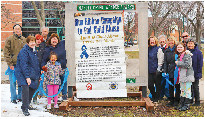
The National Exchange Club officially adopted the prevention of child abuse as its national project in 1979 and encouraged community Exchange Clubs to do the same. The Exchange Club of Owatonna is one of three local clubs.

include the Exchange Club of Owatonna, the Exchange Club of Steele County and the Moonlighters Exchange Club.