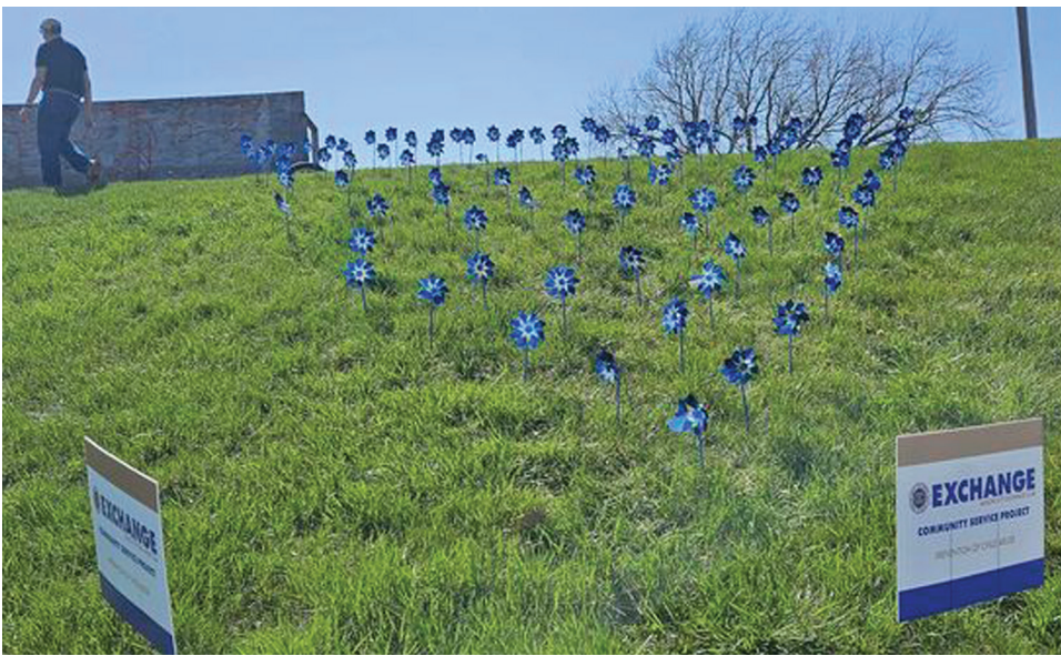
The Exchange Club of Mason City were displaying pinwheels during April's Prevention of Child Abuse Month. They were at North Iowa Community Credit Union's west branch, the North Iowa Christian School, and the above display was at the Pioneer Animal Hospital's hill by Culver's restaurant.