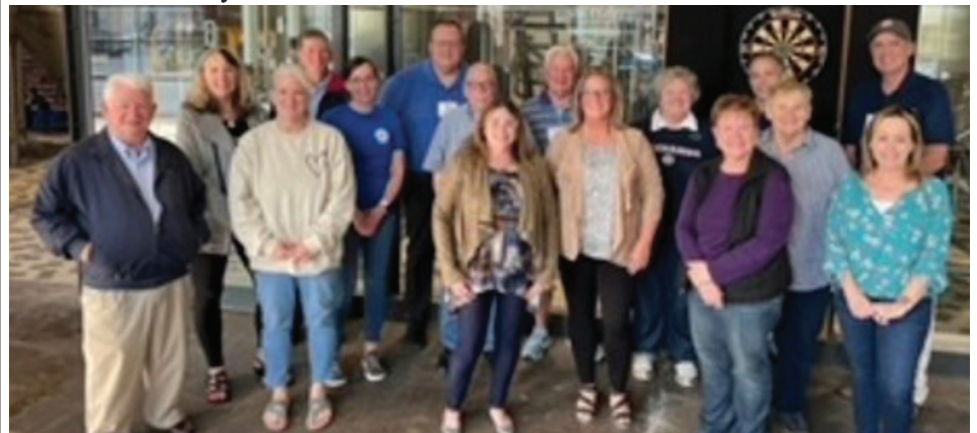
Convention attendees learned the intricacies of brewing beer at SingleSpeed.

The Lakes & Prairies District wishes to recognize members who joined their respective Exchange club during April 2023