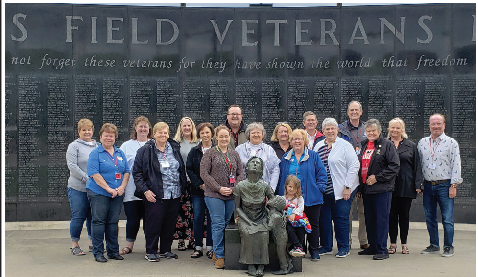
District convention attendees had an opportunity to participate in a trolley tour of historic Rochester. This group photo was captured Friday, May 20, at the Soldiers Field Veterans Memorial, home of the Exchange Club of Rochester's Freedom Shrine.

(District convention continued on Page 2)