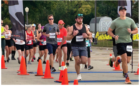
Best Dam Run

Participants make their way through the course, Sept. 23, for the Exchange Club of Waverly's Best Dam Run to prevent child abuse.