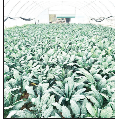
Foot Print Farms