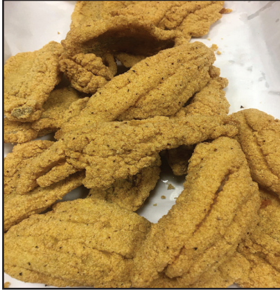
Sugar’s Place entrees

Not only is it one of the very few cuisines truly rooted and planted in America, soul food is a part of black culture that stands the test of time. No matter their modern income and social ladder climbs, it may be a challenge to find an African American who doesn’t appreciate the historic significance of