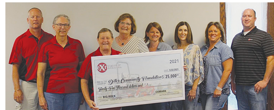
The Diller Park Improvement Project was awarded the 2021 Exmark Big Rock grant for $25,000 for construction of the Spin Zone. Exmark will also provide volunteers to help with the installation on the zone.