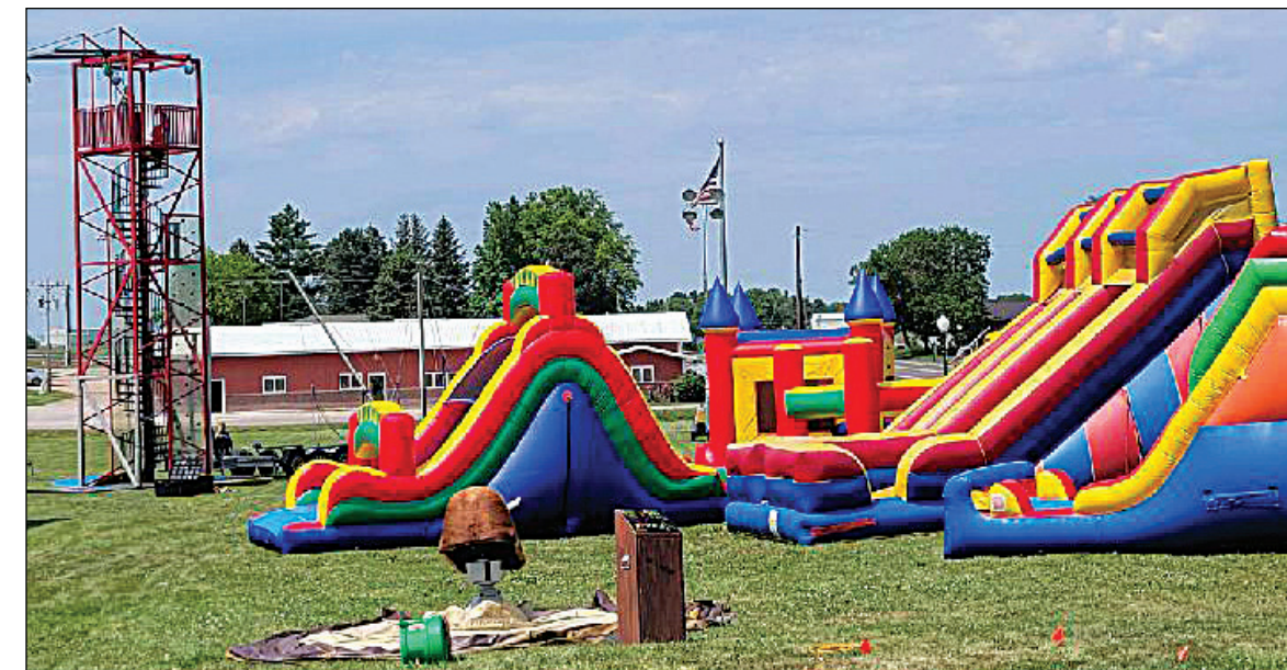
The 2021 Diller Picnic featured events and equipment through RockIT Event Pros from Kearney, NE. The Diller Community Foundation Fund funded a sponsorship for this event. These attractions were set up on the picnic grounds. Armbands were sold for hours of fun.