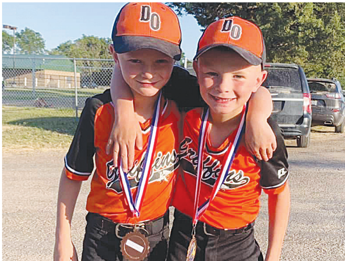
The Diller Odell Ball Association purchase new jerseys this year for both boys and girls teams. The jerseys should last several years and the kids were super excited to wear the Griffins colors as they played. This was all made possible with the support of a $750 check from the Diller Community Foundation Fund.