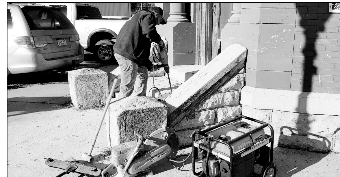
New stone steps were recently installed at the entrance of the Old Bank Museum which is a Jefferson County Historical Society site. Grant dollars from the Diller Community Foundation Fund helped cover project costs. Painting to the exterior of the building was completed and offered a welcoming appearance to guests who toured the displays during the 124th Diller Picnic weekend, June 17 - 19.

These generous community volunteers create a warm and attractive welcome for visitors and residents alike. We extend a sincere thank you for your dedication to the Diller community.