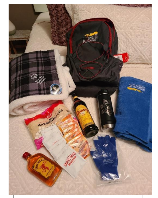
LETR backpack, towel, blanket, FOP bottle, FOP sticker, SOWA gloves, marshmallows, hot chocolate mix; apple cider mix, Fireball and Kahlua.