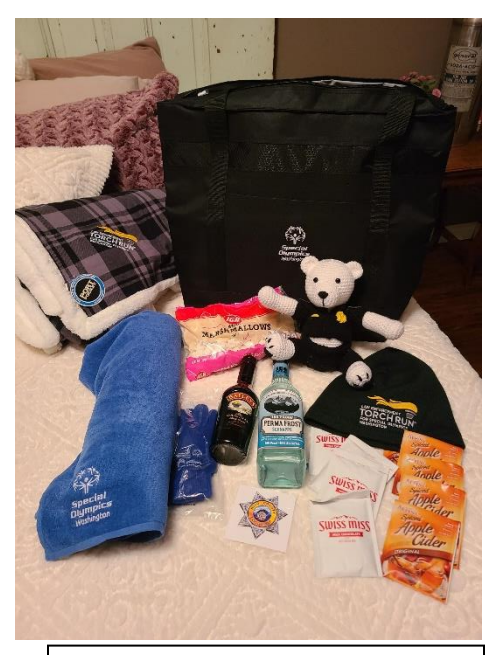
SOWA soft cooler, towel, blanket, beanie, SOWA gloves, FOP sticker, Polar Bear, marshmallows, hot chocolate mix, apple cider mix, Bailey's, and Perma Frost