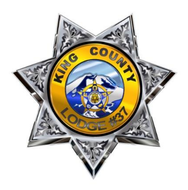
Superior service and transparency, for all

The goal of this injunction with a request for declaratory relief was to ultimately utilize the various legal and constitutional arguments to invalidate the governor's order. This would have allowed the officers and firefighters to retain employment while also submitting to reasonable accommodations, such as wearing masks and complying with testing.