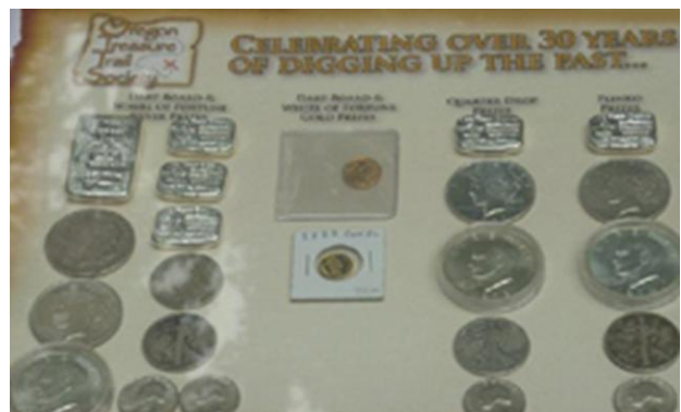
Some of the many prizes won at the OTTS Annual Club Picnic.