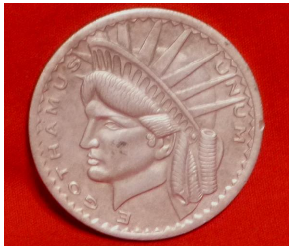
E Gothamus Unum- From all Gotham, one.