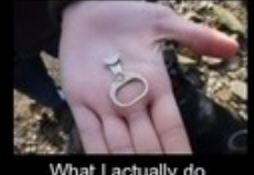
What I actually do.