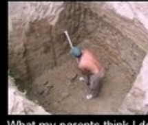
What my parents think I do.