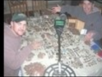
What my boss thinks I do.