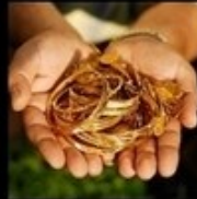
What my friends think I do.