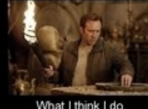
What I think I do.