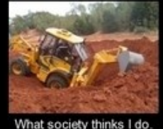
What society thinks I do.