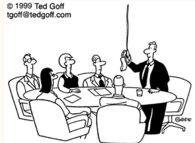
"And should there be a sudden loss of consciousness during this meeting, oxygen masks will drop from the ceiling."