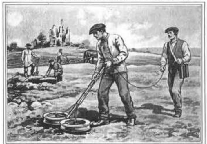
This Instrument Detects the Presence of Shells or Other Metal Buried in the Soil, Thereby Enabling the Farmer to Remove Them before Tilling a Field