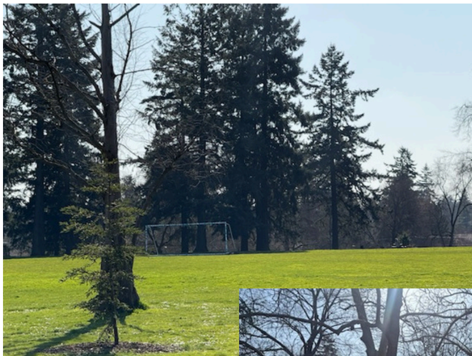
Photos of Lent's Park