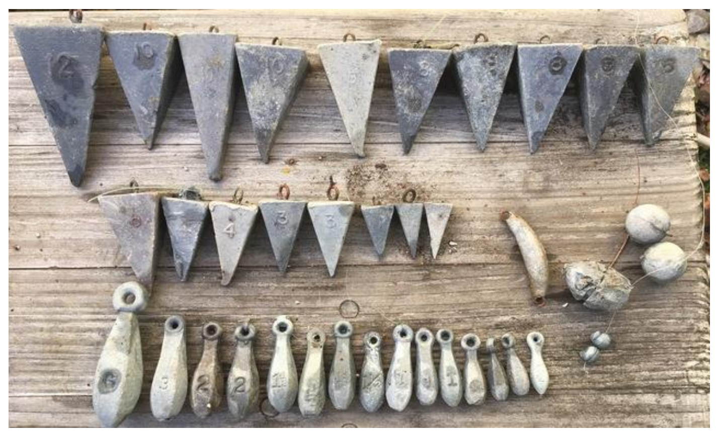
(Picture submitted by Harold V. Eight pounds of beach finds on one trip.)