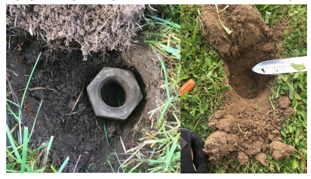
Left Picture: Great signal ended up being a nut that is around 2" across Right Picture: All that digging to find a tiny screw.

Right picture: A pull tab signal (12-27) on the ctx turned out to be a tungsten ring.