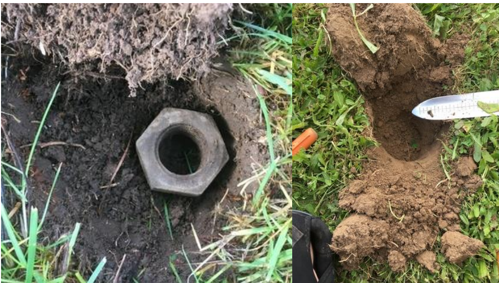
Left Picture: Great signal ended up being a nut that is around 2" across