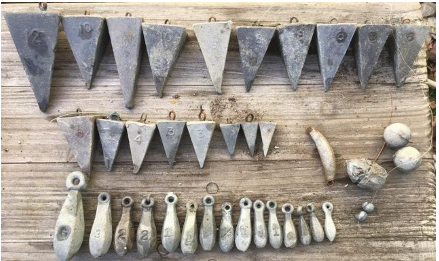
(Eight pounds of beach finds on one trip.)