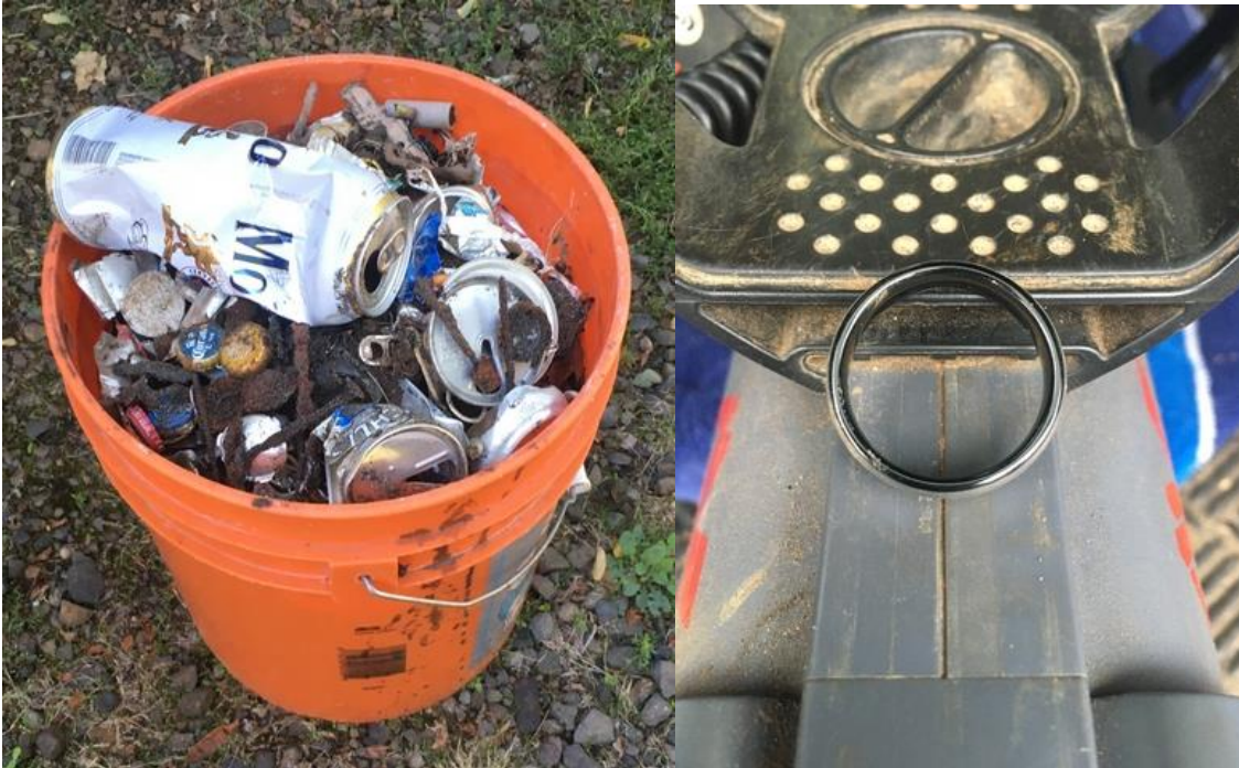
Left Picture: Filled this bucket with trash I have dug up during hunts. Started on July 5 th . Took me a little over 2 months to gather around 40 pounds of garbage.

Some pictures from some of my recent hunts.