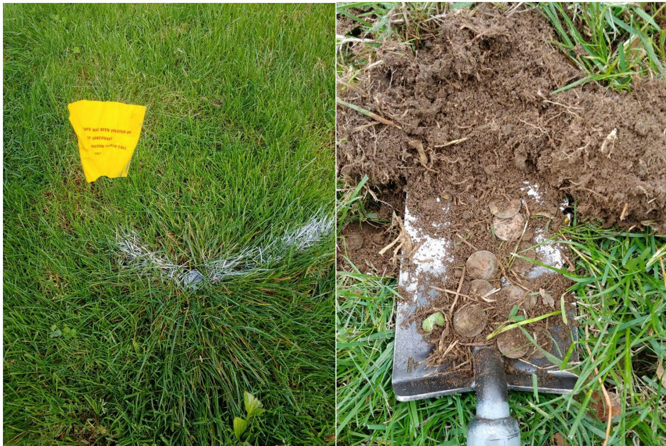
Left Picture: My lucky day. All the sprinklers were marked.