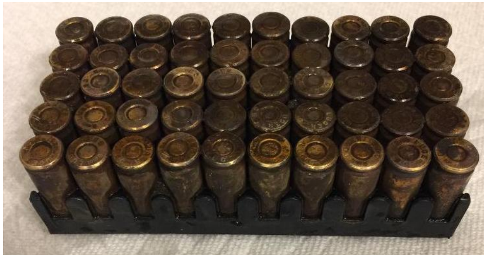
(Picture submitted by Scott J. Found full pack of bullets in the mud, at a park on the Columbia River.)