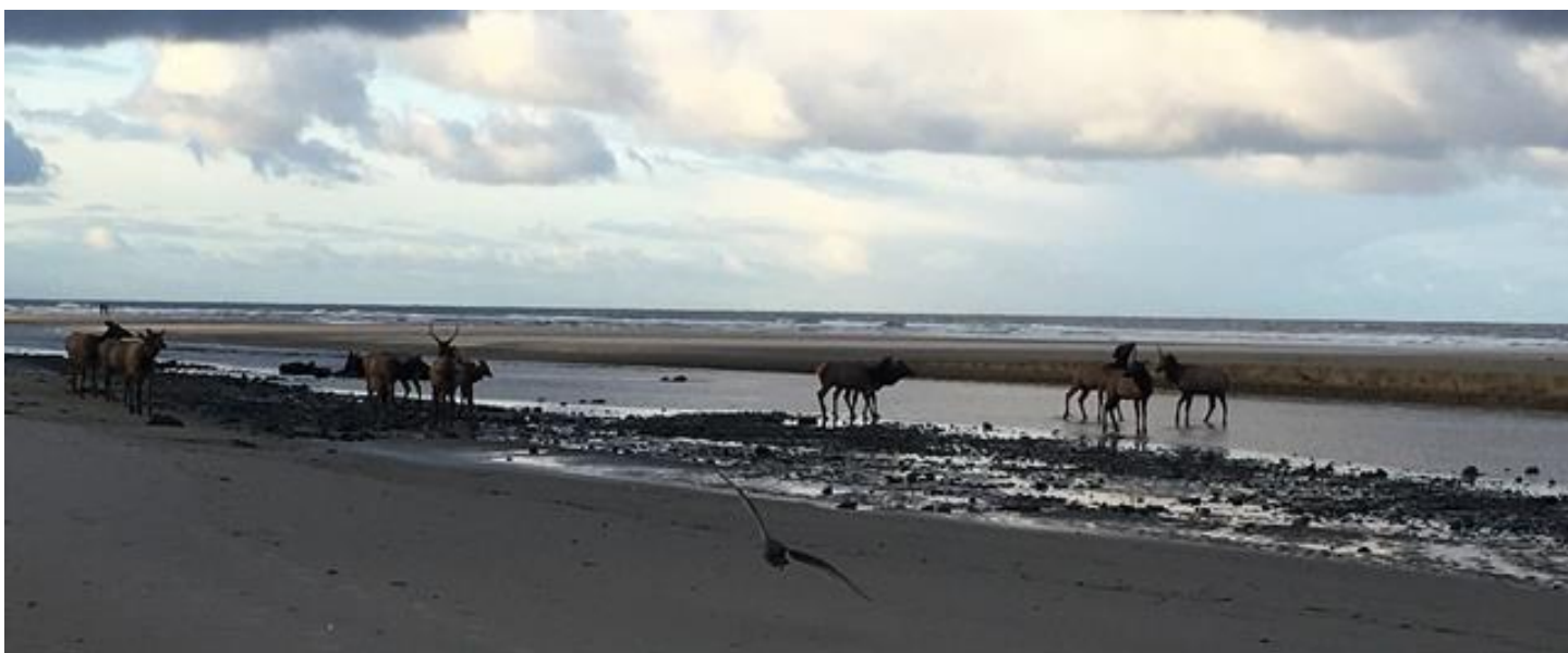
Elk at the beach.