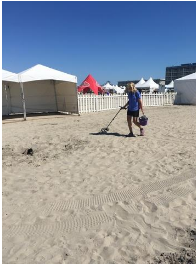
(Picture submitted by Harold V. Remember when the sun was out and it was warm?)