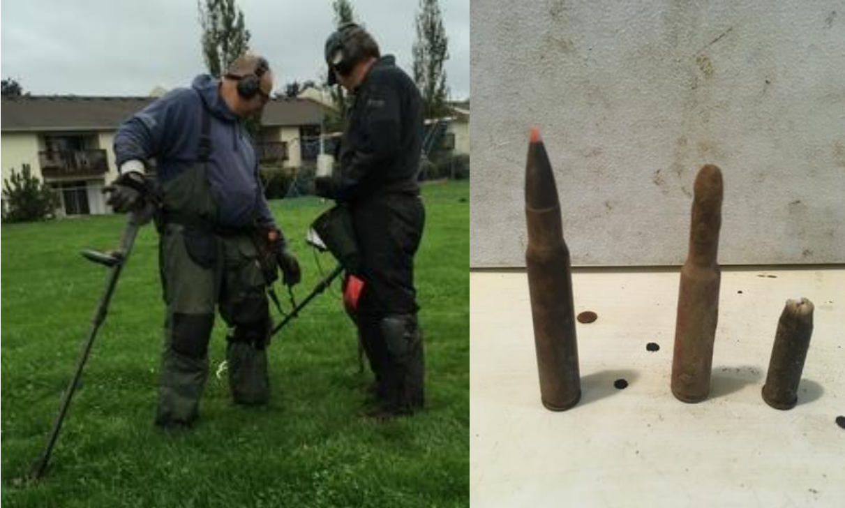
Left Picture: Pic of Jerry H showing off his ring to Tom S. Jerry found 4 silver rings that day. Right picture: Three bullets recently found at schools.