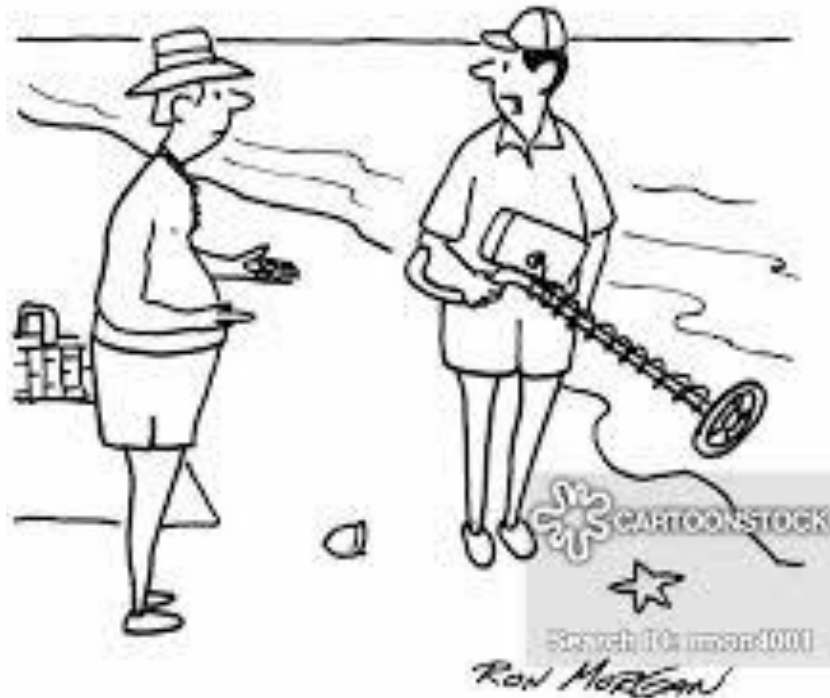
"Finding coins under your couch cushions doesn't count as finding buried treasure."

So that's the long story of my best find. Call it research. Call it luck. Call it divine intervention. Call it B.S.... Whatever. That's detecting. But I wear that ring every day and it reminds me of many things. One being that life is full of mystery. The other, that it's often too short.