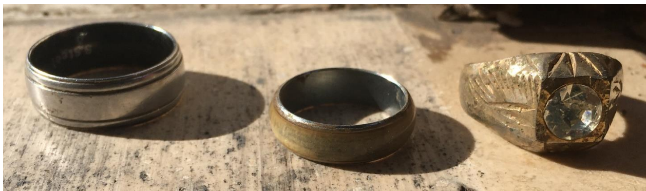
Willy A at a river beach combing for goodies.