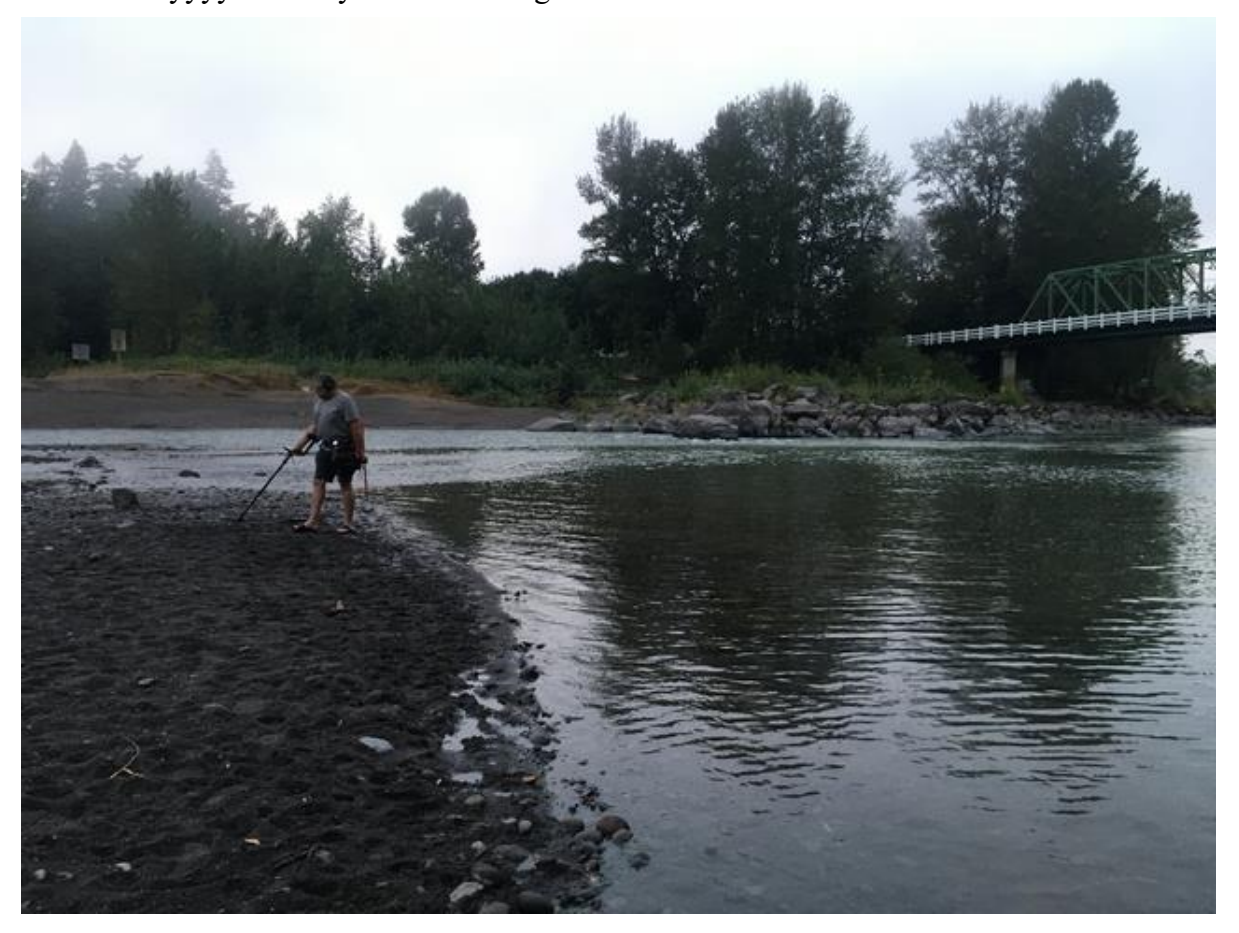
Later that morning and the sun is up enough that you can actually see Scott J.

A few pictures from some of my recent hunts. The picture below is from when Scott J and I went to a river beach waaayyyy too early in the morning. And we didn't find much.