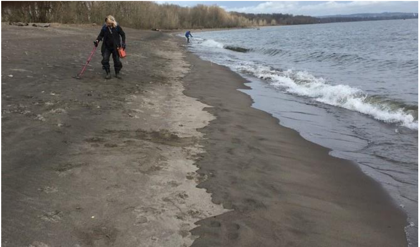
(Jerry H and Willy A doing some beach hunting.)