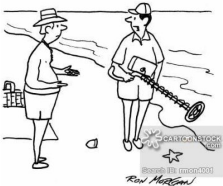
"Finding coins under your couch cushions doesn't count as finding buried treasure."