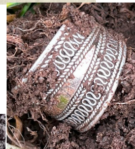
Better .925 Silver ring