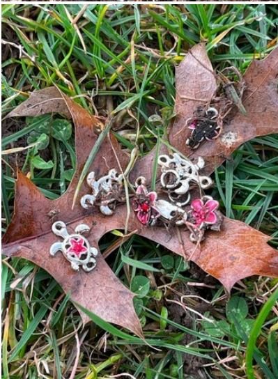
Found these scattered all over part of a field.