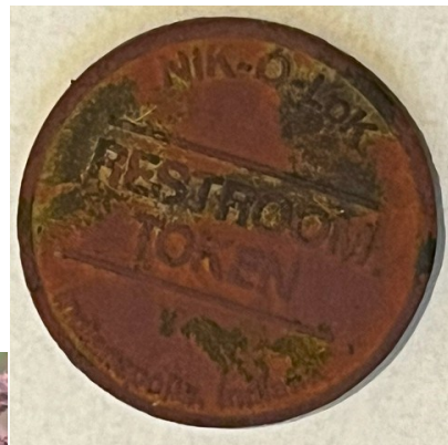
Toilet token found at Irving Park.