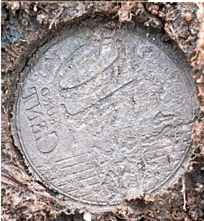
Foreign coin mud imprint.