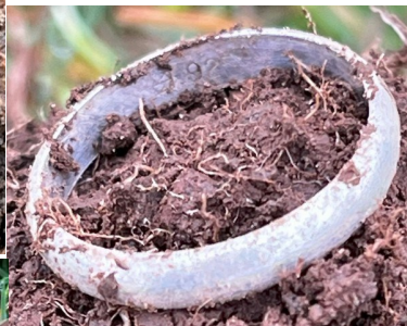
.925 Silver ring