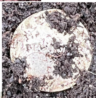
The pair really looked gold coming out of the ground. Too bad I cleaned them up.