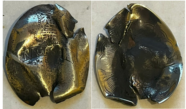
Nagasaki spoon bowl.

I actually found 3 silver coins in one weekend.