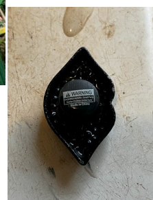
I have found several of these things which I am told are croc shoe accessories.