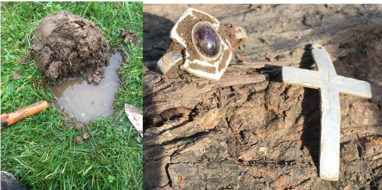
Left Picture: Does this look familiar? Wet, wet, wet. This isn't even at the beach.