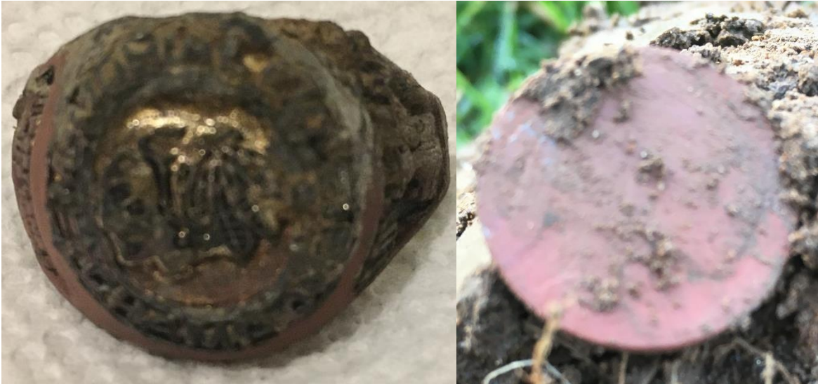
Left Picture: Busted up ring that says Portland Timber Hawks Memorial Cup Champions.