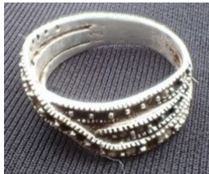
Silver Ring found by Ron B