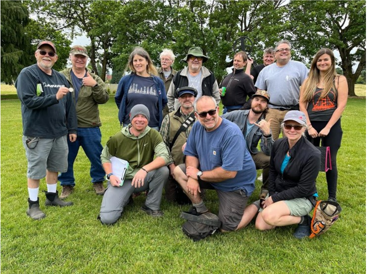
Oregon Treasure Trail Society members at the Fernhill Club Hunt.