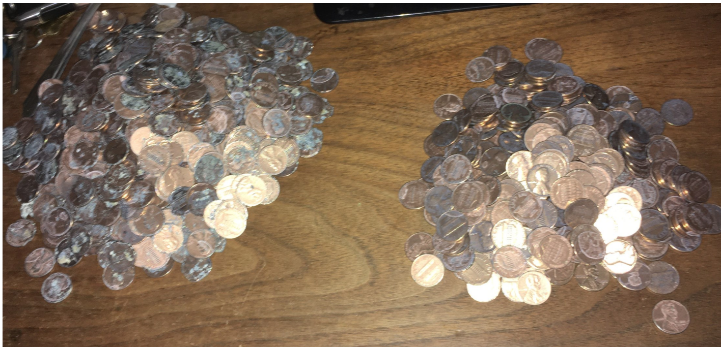
Submitted by Harold V: Ugly Pennies vs Spendable Pennies. Not a good ratio.