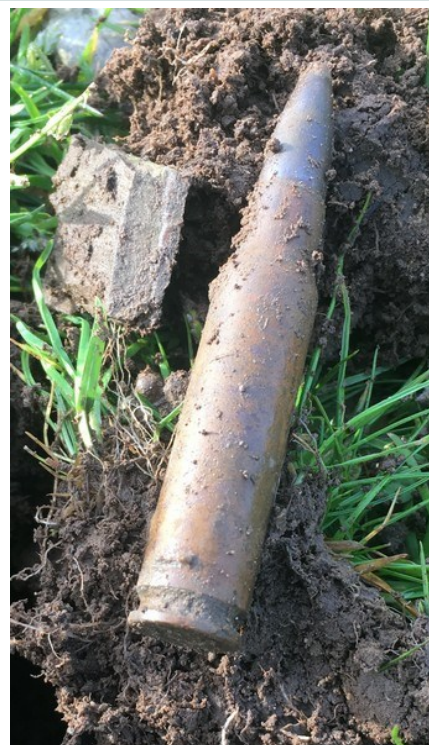
Found at an Elementary School