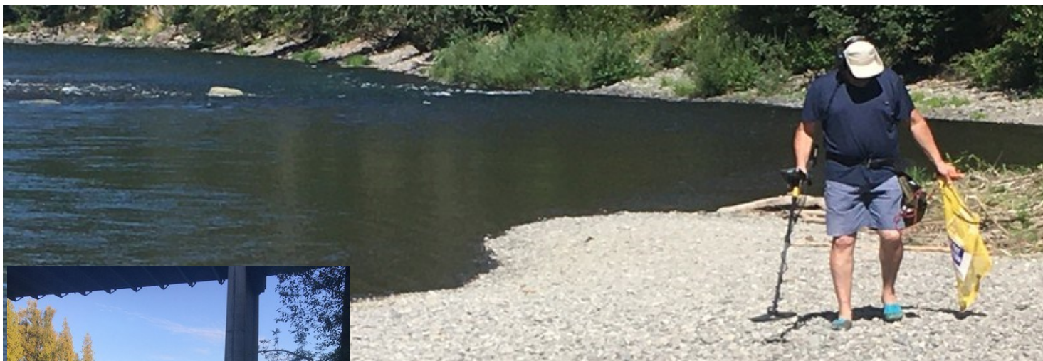
For me this is the opitmi of river detecting. Detector in one hand and garbage bag in the other.