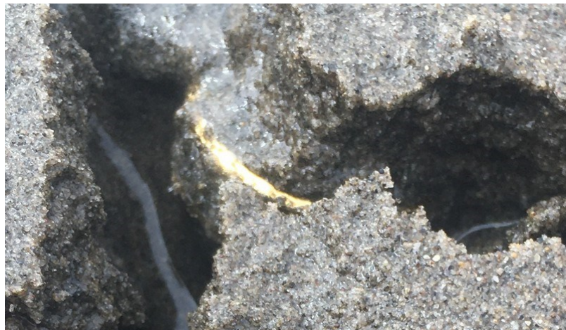
I saw this gold poking through the sand and I thought for sure I had a nice big gold ring. I was sorely disappointed.