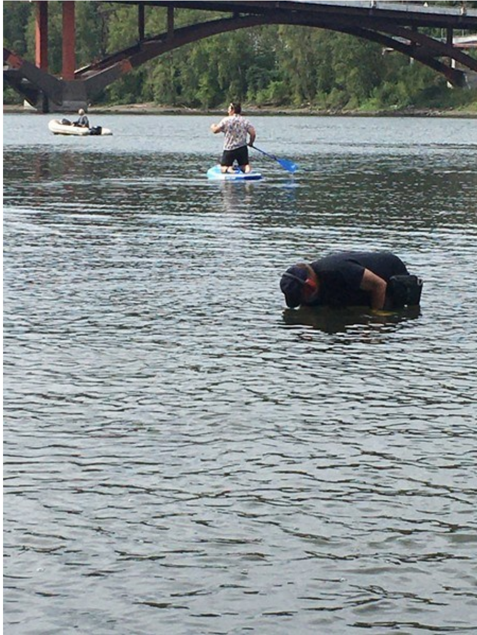
A dedicated detectorist at the Club Hunt.