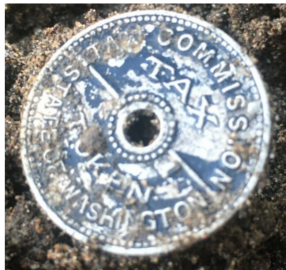
Found my 2nd WA State Tax Token