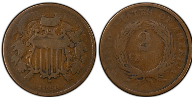
Win this coin next month!