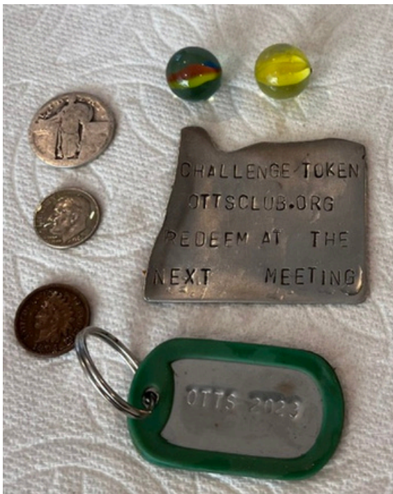
What was contained in the token package