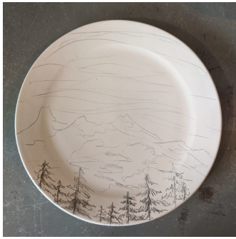
Sketching design out with pencil