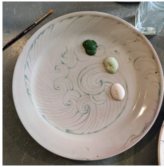
Picking out underglaze