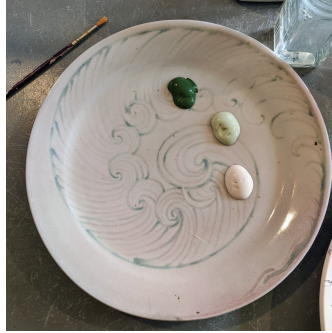
Picking out underglaze