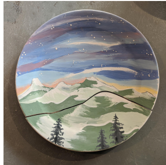
Finished underglaze painting