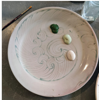
Picking out underglaze