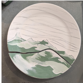
Hills are now complete