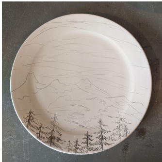
Sketching design out with pencil