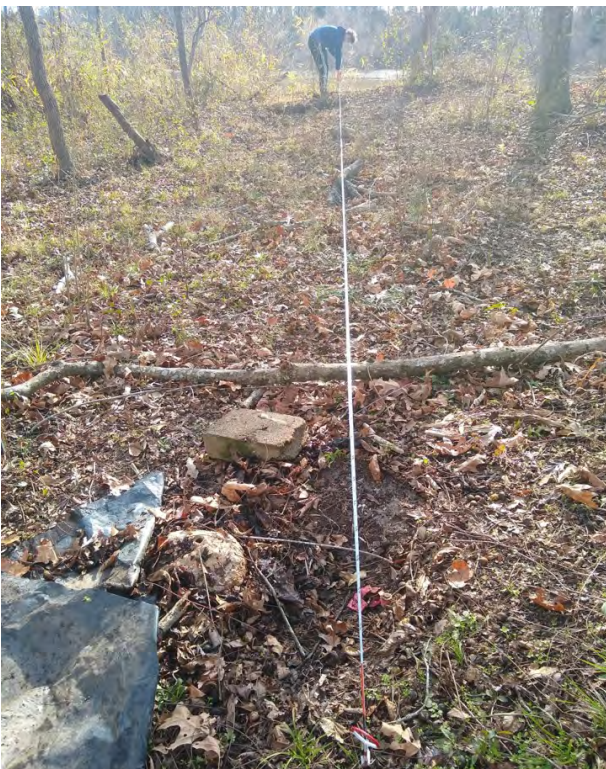
Seamus Judge pulls a measuring tape from a known point along a consistent compass heading to the eroding riverbank.

In January of 2021, I began working on a 10-year grant-funded study monitoring erosion at a Native American mound site in the Wateree River Valley. This archaeological site dates between 1200 A.D. and 1700 A.D. and has been eroding since it was first observed in the early 19th century. The mound is an artificial landscape feature built by Native Americans of clay and silty soils with a flat top or platform. Built by hand in stages with baskets of earth and sod blocks, the tops of these mounds were used for structures such as residences for chiefs, temples, or standing mortuary structures. A series of these mounds were recorded in a 25-mile radius of Camden by a local physician beginning in 1806; a letter report of his observations was published in 1848 by the Smithsonian in one of the first archaeological studies in the United States.