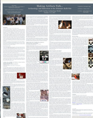
Left: Front of poster above: Back of poster