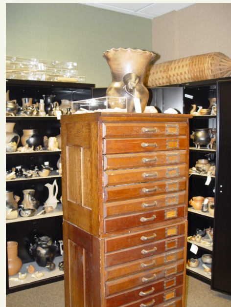
Photo of the collection room