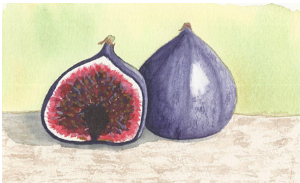
Untitled work by DeAnn Beck.

“The View from My Window” will be on display in the Five Points Gallery until March 1, 2019. Starting December 1, Beck will be selling her pieces at 50% off selling price until the end of the exhibit.