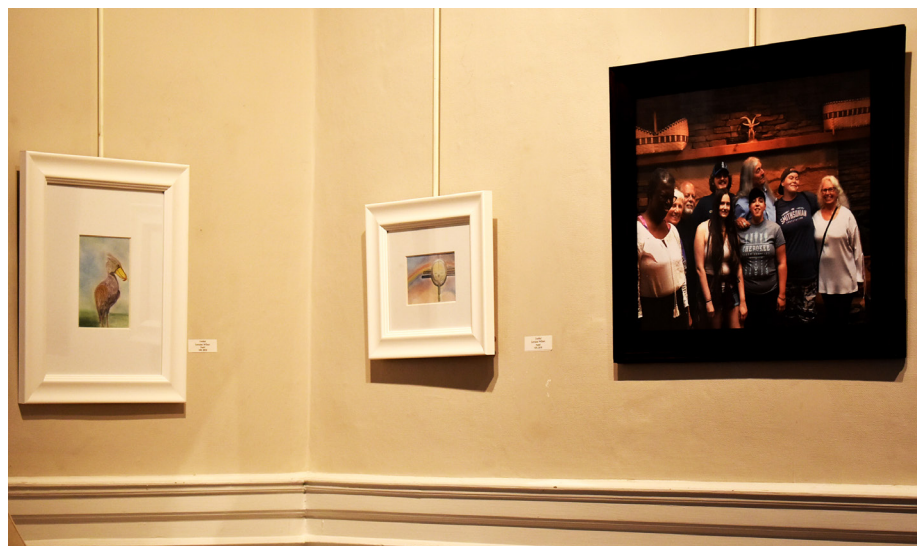
Untitled watercolors by Lorainne Wilner and photo in frame by Stephen Criswell.

"Changing Perceptions: USC Lancaster Travel Study 2018" is on display at the Springs House until Dec. 30, 2018.