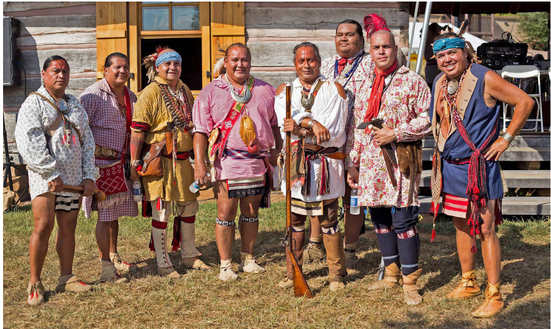
The Warriors of AniKituhwa.

The War Dance was used not only when men went to war, but also when meeting with other nations for diplomacy and peace, and within the Cherokee Nation was also used to raise money for people in need. It conveys the strength of the Cherokee Nation.