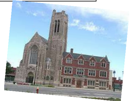
Historic Trinity Lutheran