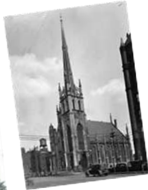
Fort Street Presbyterian