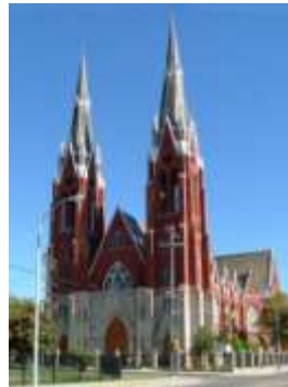
Sweetest Heart of Mary, Roman Catholic