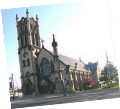
St. John's Episcopal Church