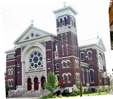
St. Charles Borromeo Roman Catholic