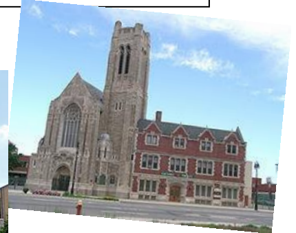
Historic Trinity Lutheran