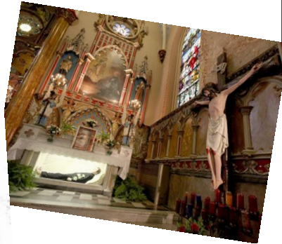
St. Albertus Roman Catholic